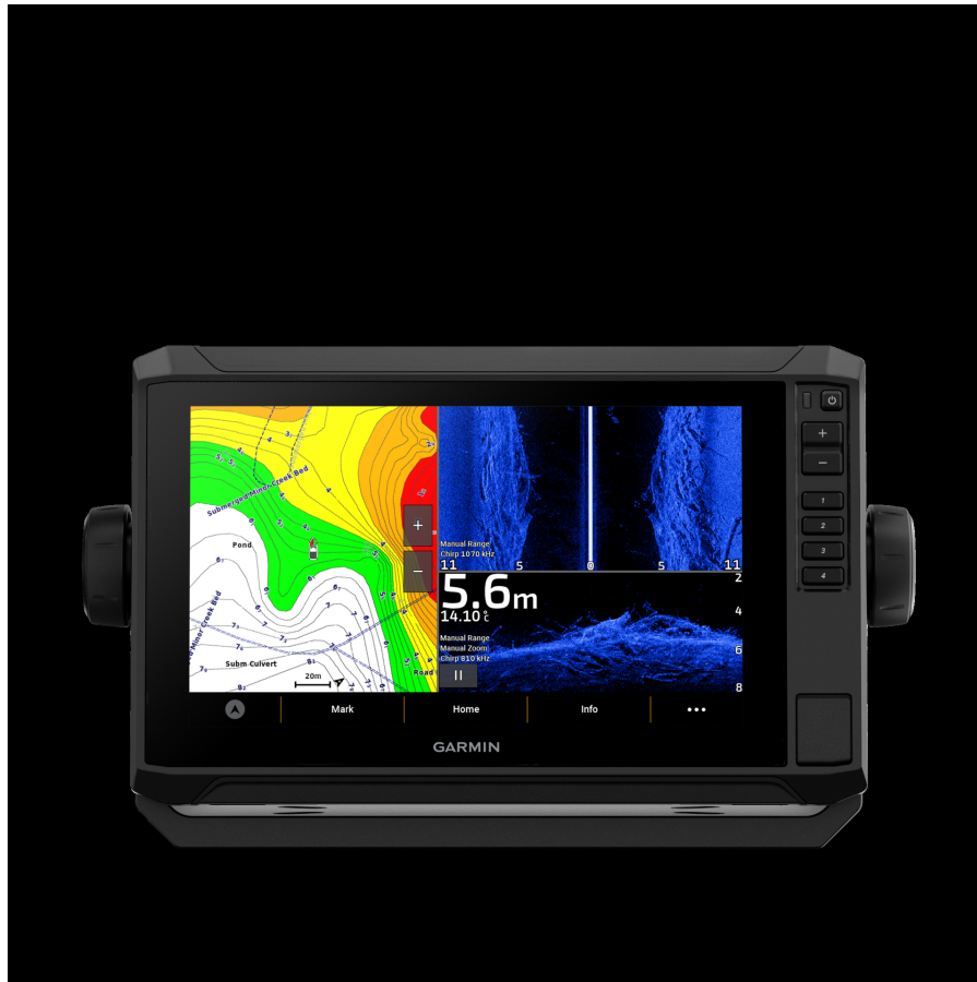
Garmin ECHOMAP™ UHD2 95sv with GT56UHD-TM Transducer - 010-02690-20